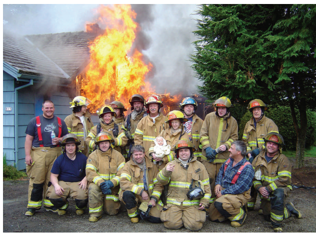
FIRE SAFETY STARTS AT HOME